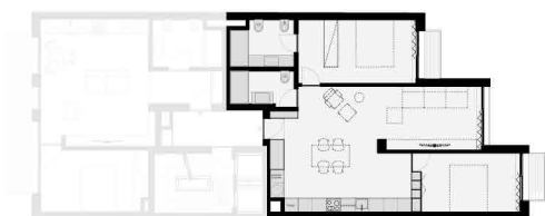
LEVEL 4 - APARTMENT 4B